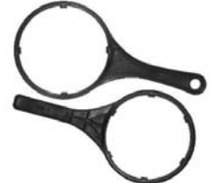
Big Boy & Big Blue